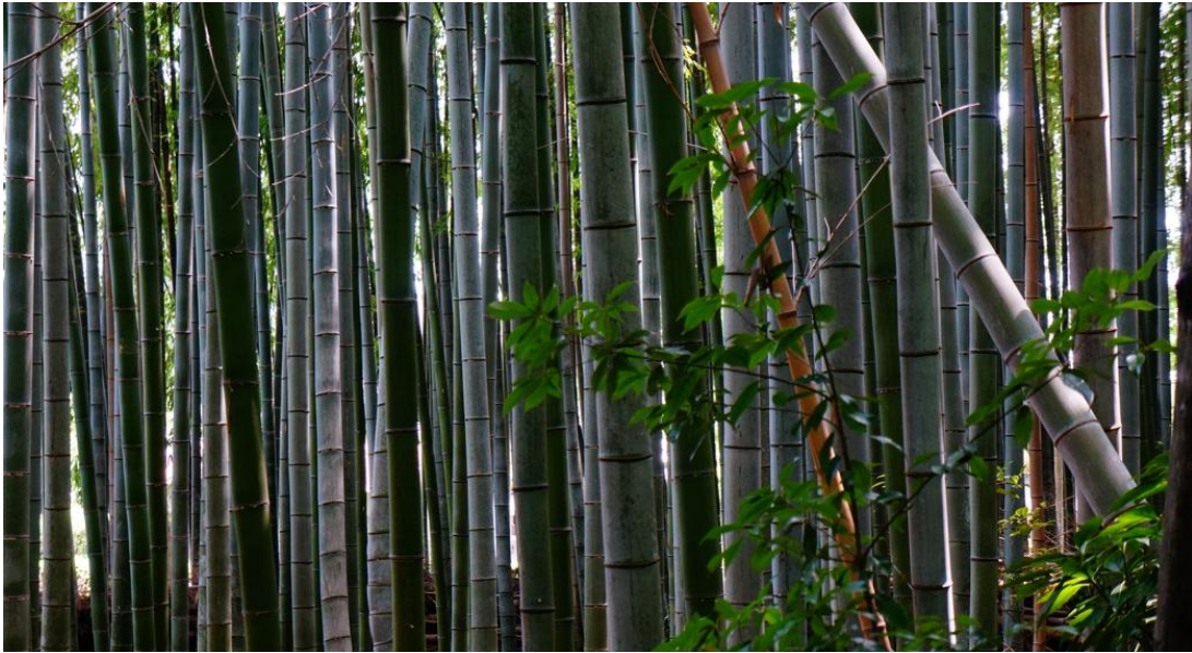
Madake and Mōsō-chiku mixed in Jizō-in, the bamboo temple in Kyoto.