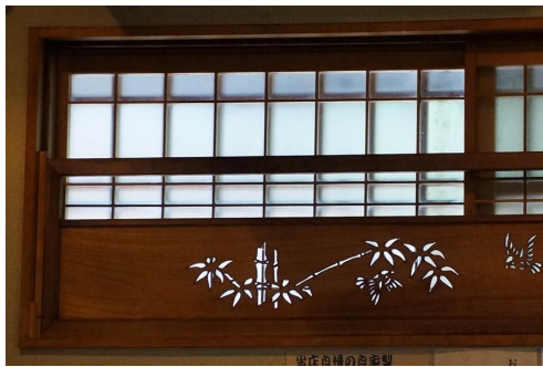
Left: This Ranma depicts a madake bamboo