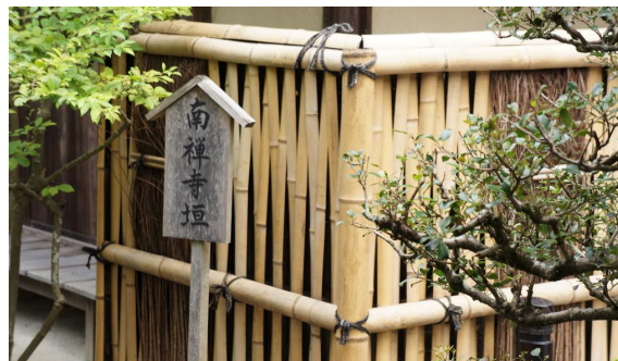
Right: The fence Nanzenji-gaki is built with madake bamboo