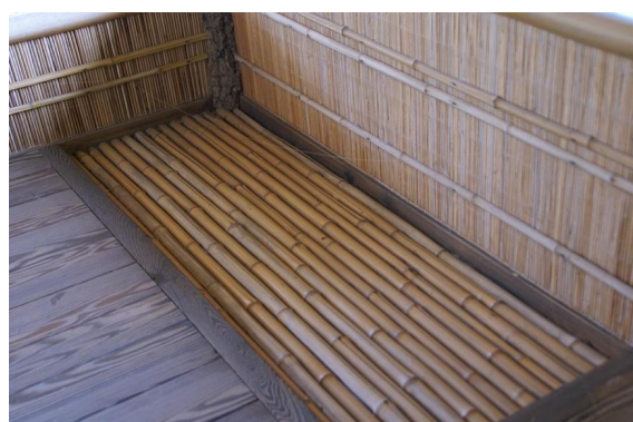
Right: Outdoor tea room in the Katsura Rikyu gardens